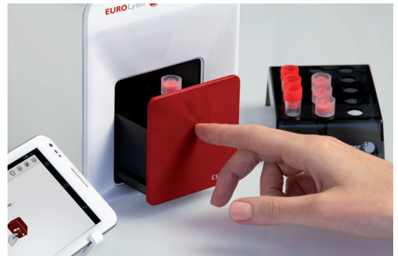
D | Close the door – done!

The Eurolyser point-of-care systems can measure CRP, hsCRP, HbA1c, PT (INR), HGB and CysC from whole blood samples in a single test format. Tests for