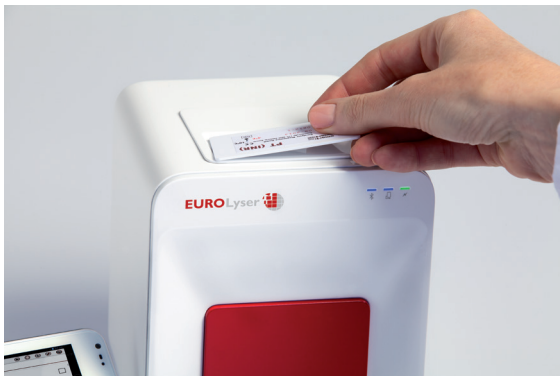
A | Position the RFID card

Only four simple steps (as seen here for the CUBE):