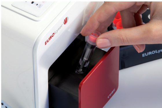
C | Insert the cartridge