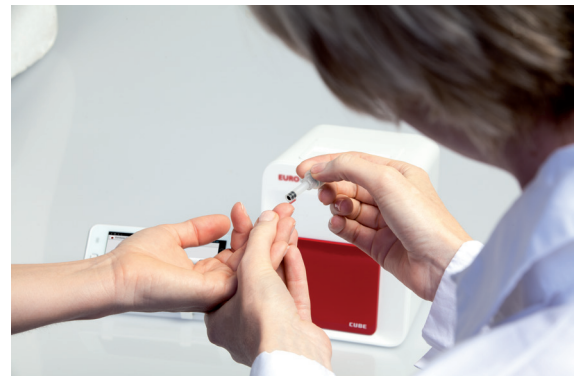
B | Collect a sample